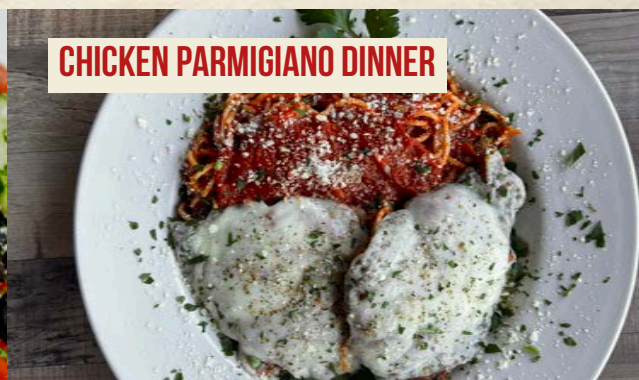
CHICKEN PARMIGIANO DINNER