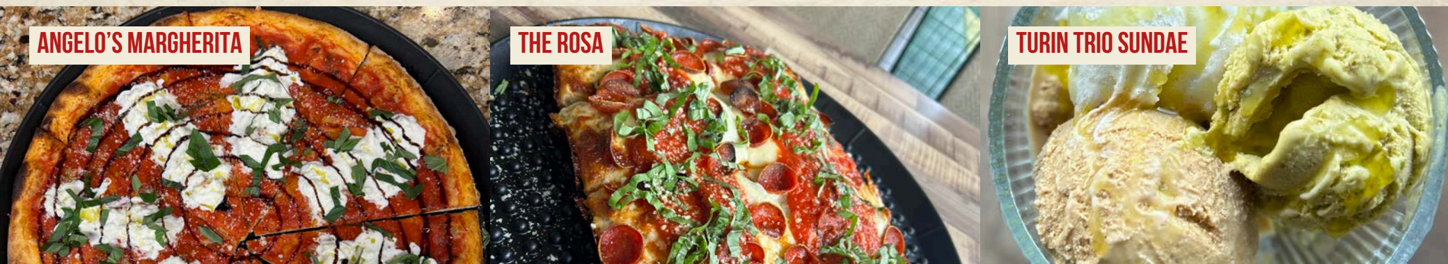
TURIN TRIO SUNDAE